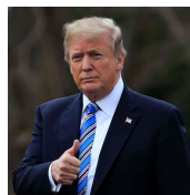
Donald J. Trump President