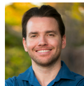
Kevin Kiley Assemblyman AD 6