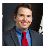
Assemblyman Kevin Kiley for Re-Election (Dist. 6) kileyforassembly.com