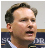
Andreas Borgeas Senate (Dist. 8) borgeas2018.com