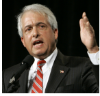
John Cox Governor johncoxforgovernor.com

Recommendations from the Sacramento County Republican Party