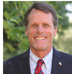
Sen. Ted Gaines Board of Equalization (Dist. 1) tedgaines.com