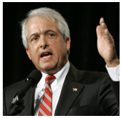
John Cox Governor

Recommendations from the Sacramento County Republican Party