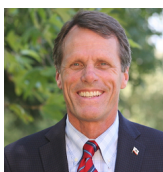
Sen. Ted Gaines Board of Equalization (Dist. 1)