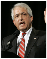
John Cox Governor

Recommendations from the Sacramento County Republican Party