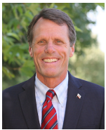
Sen. Ted Gaines Board of Equalization (1)